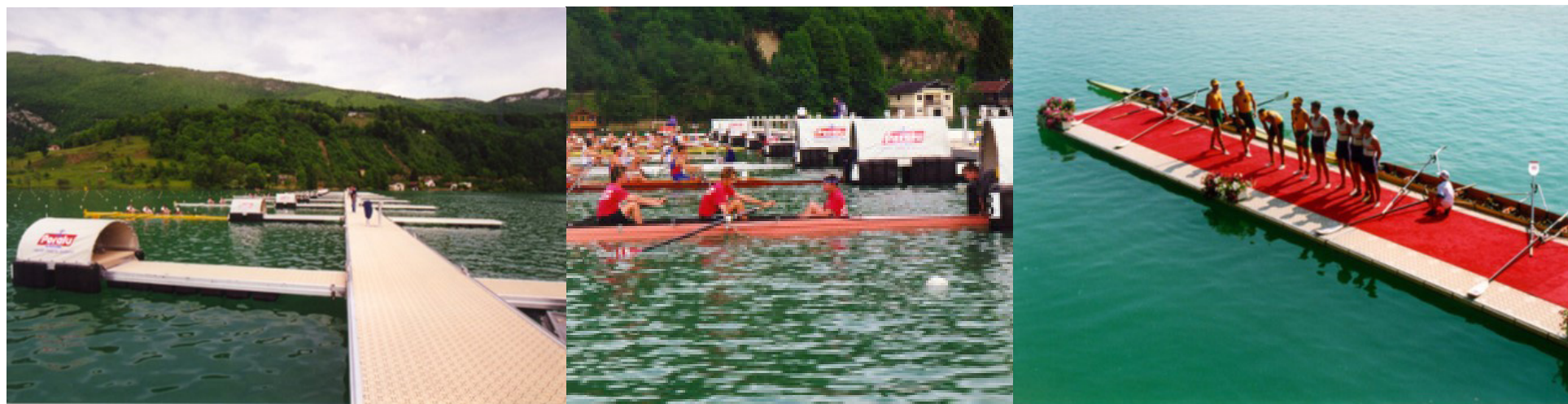
WORLD ROWING CHAMPIONSHIP 1997 - AIGUEBELETTE FRANCE