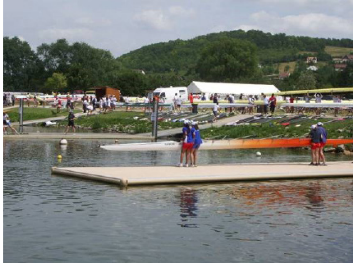
MANTES LA JOLIE - FRANCE