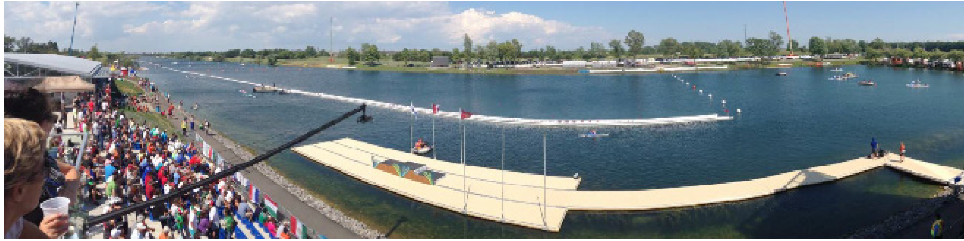
OLYMPIC GAMES 2012 - LONDON - UK