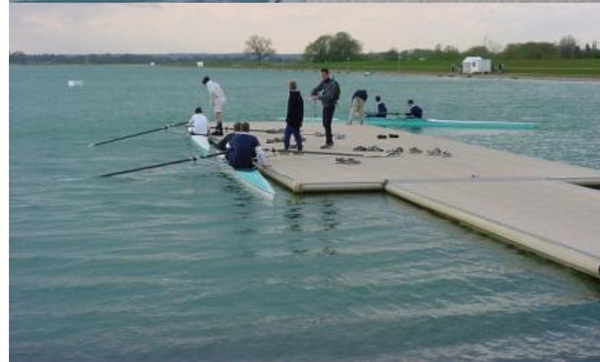
ETON - UK - 2012 - Launch pontoons.