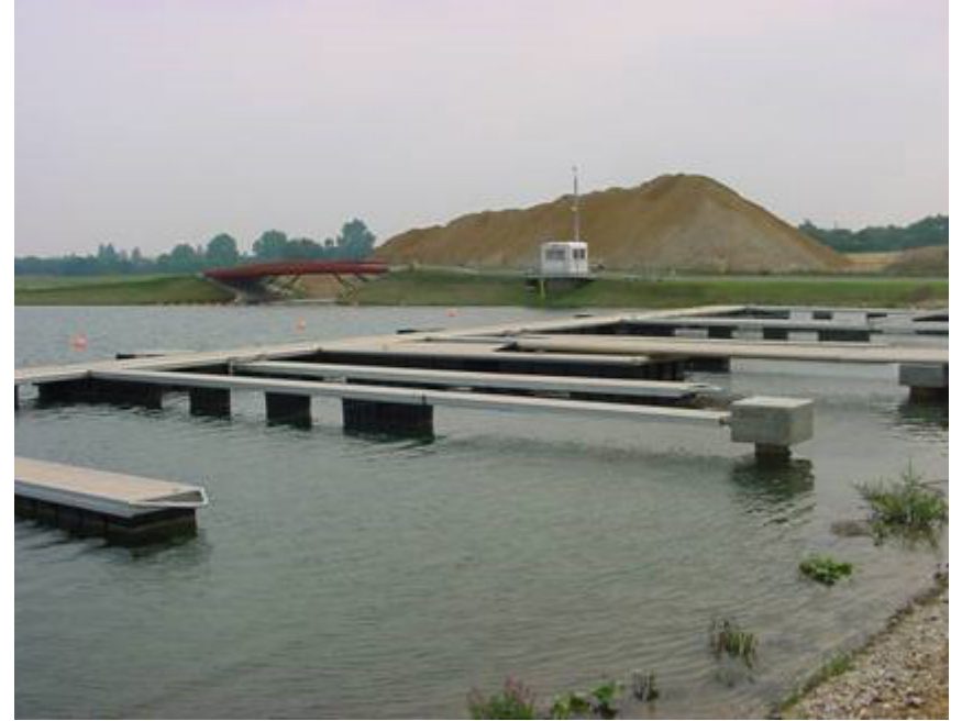
ETON - UK - 2012 - Start pontoons.