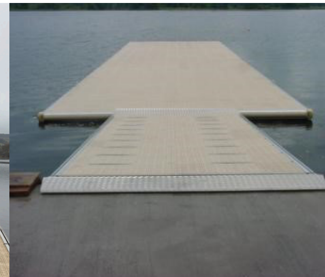
CASTLE SEMPLE - UK - Launch pontoons.