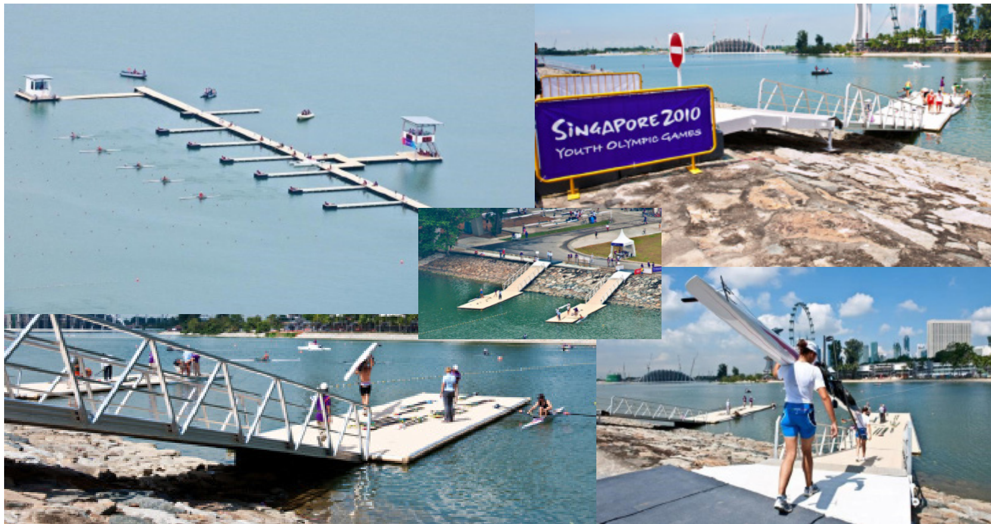
YOUTH OLYMPIC GAMES 2010 - SINGAPORE