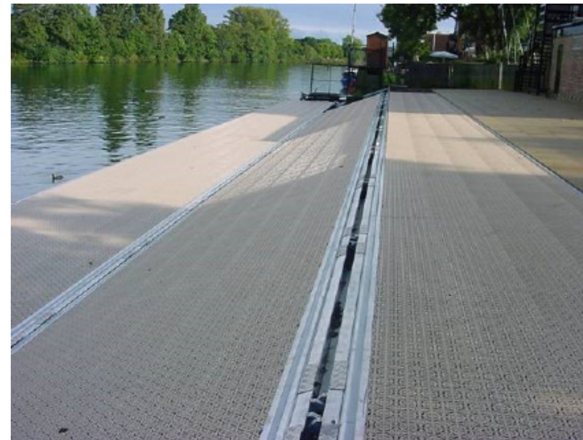
GRAMMAR SCHOOL - UK