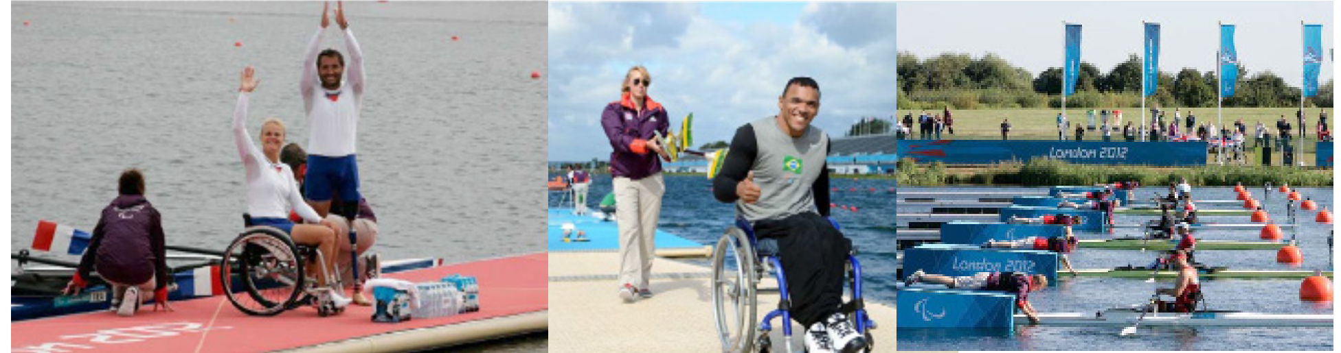
PARALYMPIC GAMES 2012 - LONDON - UK