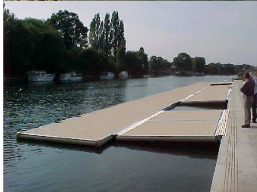
DORNEY LAKE - UK