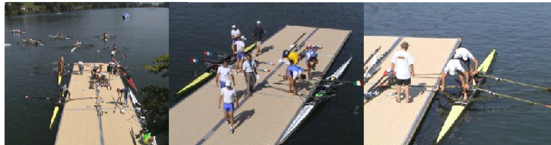
WORLD ROWING CHAMPIONSHIP 2001 - LUCERNE